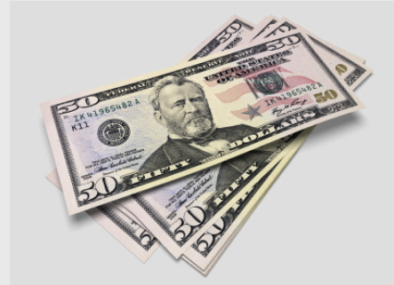
Ulysses $ Grant