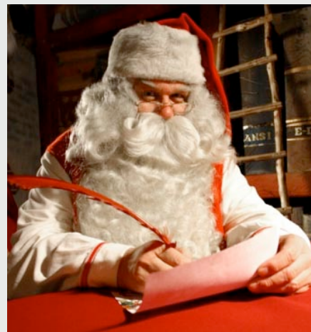
For illustrative purposes. Not a real PI. As far as we know.

Don't forget to list all materials and solutions that are required to perform experiments. This will be further explored in individual sections below.