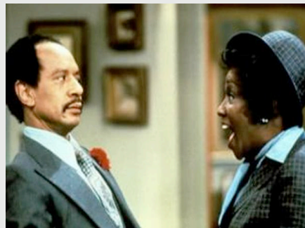
Movin' on up

Start an Excel spreadsheet with all of the above information, organized by dates, timeline, and other pertinent information.